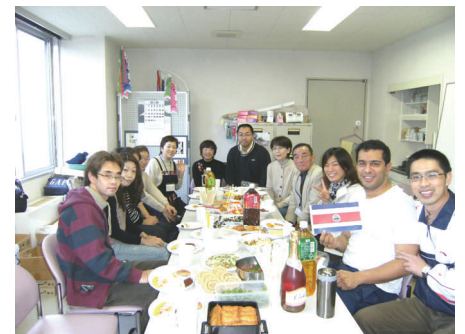
Potluck party is held once a month at UMEM salon