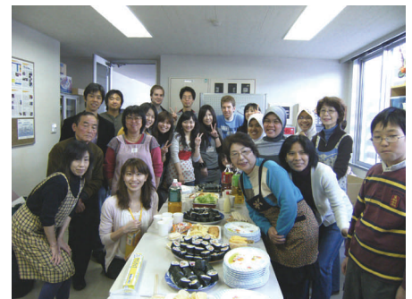
Potluck party is held once a month at UMEM salon