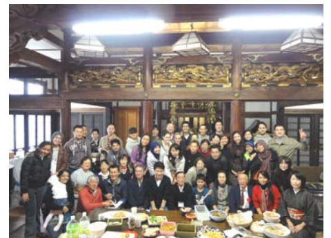
New Year's party

UMEX activities will be decided at the meeting of the working committee to be held at the beginning of every month. Please let us know if you have any suggestions and requests.