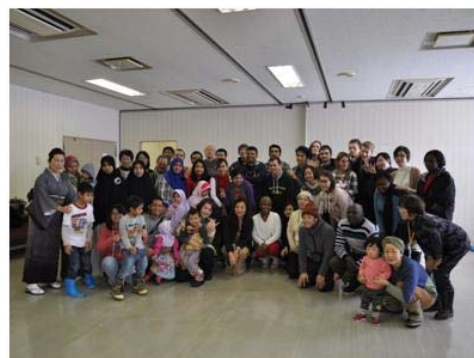
New Year's party

UMEX activities will be decided at the meeting of the working committee to be held at the beginning of every month. Please let us know if you have any suggestions and requests.