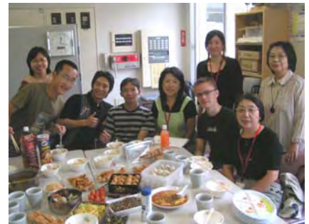
Friday Luncheon gathering is held once a month at UMEM salon

Members gather twice a week in the UMEM salon located at the IUJ Student Dormitory No. 3, first floor. The salon is open every Tuesday and Friday, from 13:00 - 15:00 and 19:00-20:30 respectively.