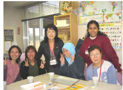
Friday Luncheon gathering is held once a month at UMEX salon

Members gather twice a week in the UMEX salon located at the IUJ Student Dormitory No. 3, first floor. The salon is open every Tuesday and Friday, from 13:00 - 15:00 and 19:00-20:30 respectively.