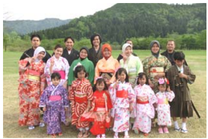
Bus trip for introduction of Japanese culture